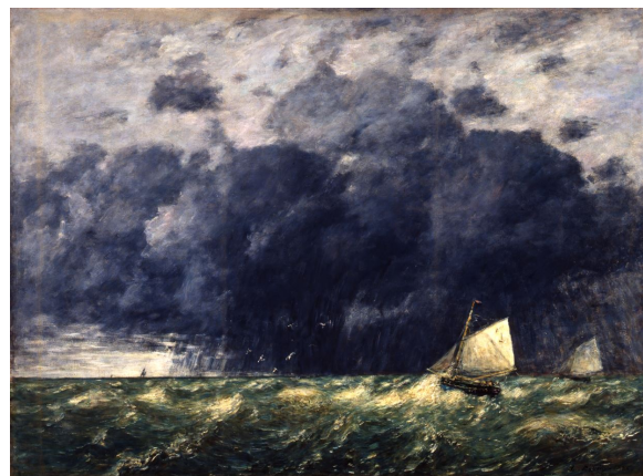
Eugène Boudin (1824-1898), Squall, 1886, oil on canvas, 117 x 160 x 3 cm, Morlaix Museum

The musée de la Vie romantique invites visitors to discover an emblematic and fascinating theme from the first half of the nineteenth century and one of the most powerful sources of inspiration for the Romantics: storms and shipwrecks. This exhibition aims to broaden the museum's program beyond the collections focusing on life in the Parisian salons by exploring the pictorial diversity of Romanticism and putting a spotlight on the new way of looking at nature and seascapes as a reflection of the Romantic soul.