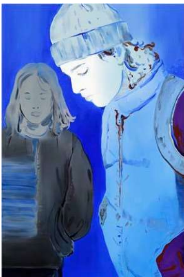
Françoise Pérovitch, Untitled , 2023, oil on canvas, diptych, 240 x 160 cm © A. Mole, Courtesy Semiose, Paris © Adagp, Paris, 2023

During their tour, visitors can discover a documentary produced by Hervé Plumet on Françoise Pérovitch's creative work for the Musée de la Vie Romantique. The exhibition is also designed for schools and teenagers, who will discover a modern view of young people and their feelings. A participative project carried out with pupils from the Collège Marx Dormoy – a secondary school in Paris' 18th arrondissement - and the Fonds d'Art contemporain - Paris collections is also on display as part of the tour. Visitors can download the 9 pieces of sound art created by the pupils, inspired by the artist's work.