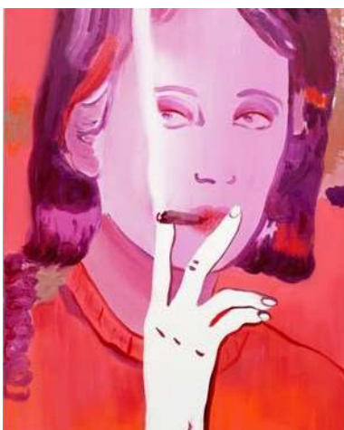
Françoise Pérovitch, George Sand , 2023, oil on canvas, 91 x 73 cm